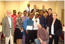
ACE Mentoring Program

The Michigan office demonstrates its dedication to the community it serves in copious ways each year. Our employees are encouraged to reach out and get involved in efforts that take place within their local communities and are core members within affiliations, participate in charitable events and embrace volunteering in local and national nonprofits.