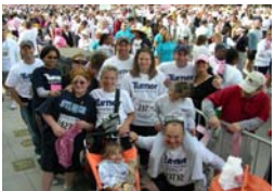
Race for the Cure