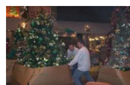
Festival of Trees