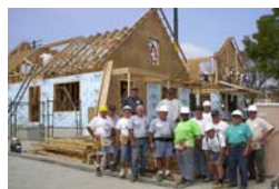
Habitat for Humanity